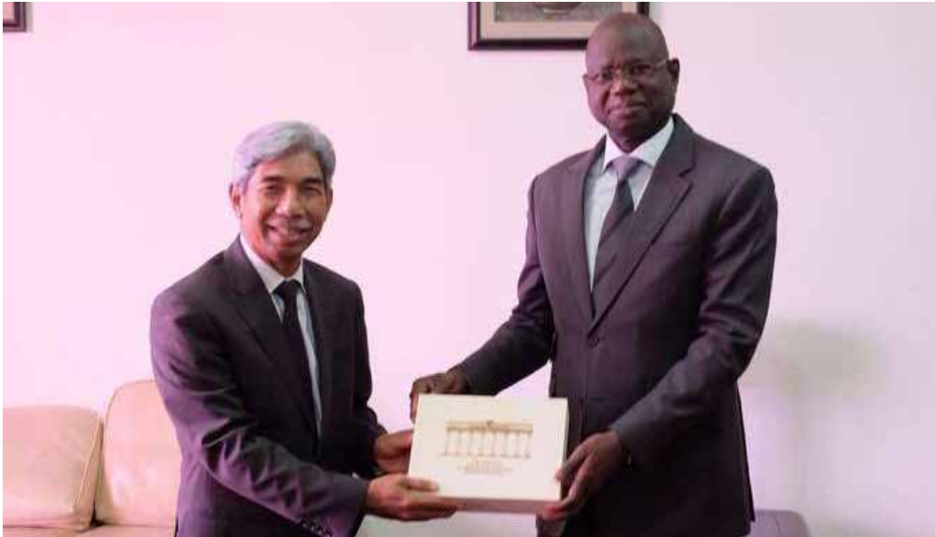
RI's Deputy Foreign Minister A.M. Fachir meets with Senegal Defense Minister Augustin Tine in Dakar,

The Indonesian Ministry of Foreign Affairs is seriously promoting economic diplomacy. Various efforts are done continuously including visits by RI's Deputy Foreign Minister, Dr. A.M. Fachir, to African countries; one of them is a visit to Senegal. Senegal has economic growth above 6% in the last 6 years. Senegal has a dynamic growth and is open for Indonesian investments.