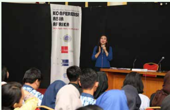
Student members of the Student Protocol Corps (KPM) from various campuses in West Java discuss interactively with Foreign Ministry resource persons.

Saturday (10/6/2017) afternoon, 80 students from various campuses in West Java such as Padjadjaran University, UIN Sunan Gunung Djati, and Universitas Kuningan gathered at the KAA Museum to fill the 15th day of this year's Ramadan with positive activities, such as discussions around etiquette and protocol.