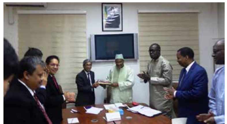
RI's Deputy Minister of Foreign Affairs A.M. Fachir met with the Secretary of State on the National Railroad of Senegal Abdou Ndene Sall in Dakar, Senegal (8/6).

The bilateral meetings are both part of the Foreign Ministry's 2nd African tour. The Deputy Minister of Foreign Affairs visited Senegal and Kenya, following the visit of Foreign Minister Retno to Nigeria. Also attending the meeting were Ambassador Dakar, Mansyur Pangeran, and the President Director of PT. PAL Indonesia, Budiman Saleh. []