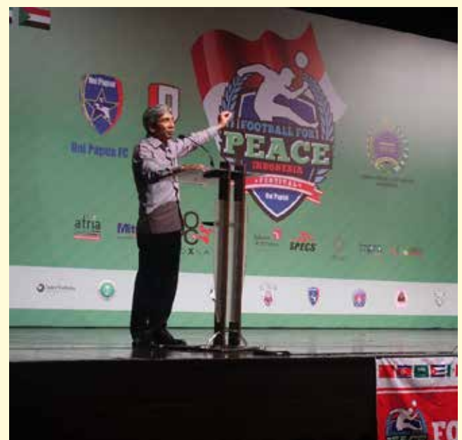
Deputy Minister of Foreign Affairs of the Republic of Indonesia Mr. A.M. Fachir gave a speech at UPFC Gala Dinner on May 5, 2017.