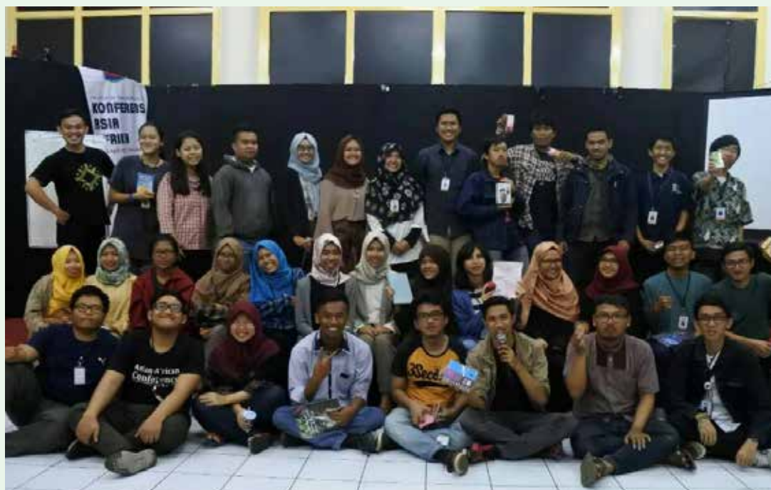
Members of Sahabat Museum KAA crowded the SMKAA Fellowship event at Galeri I Museum KAA on Sunday (11/06/2017).

The question and answer lasted until the call for evening prayers. All participants along with the museum workers broke the fast together.[]